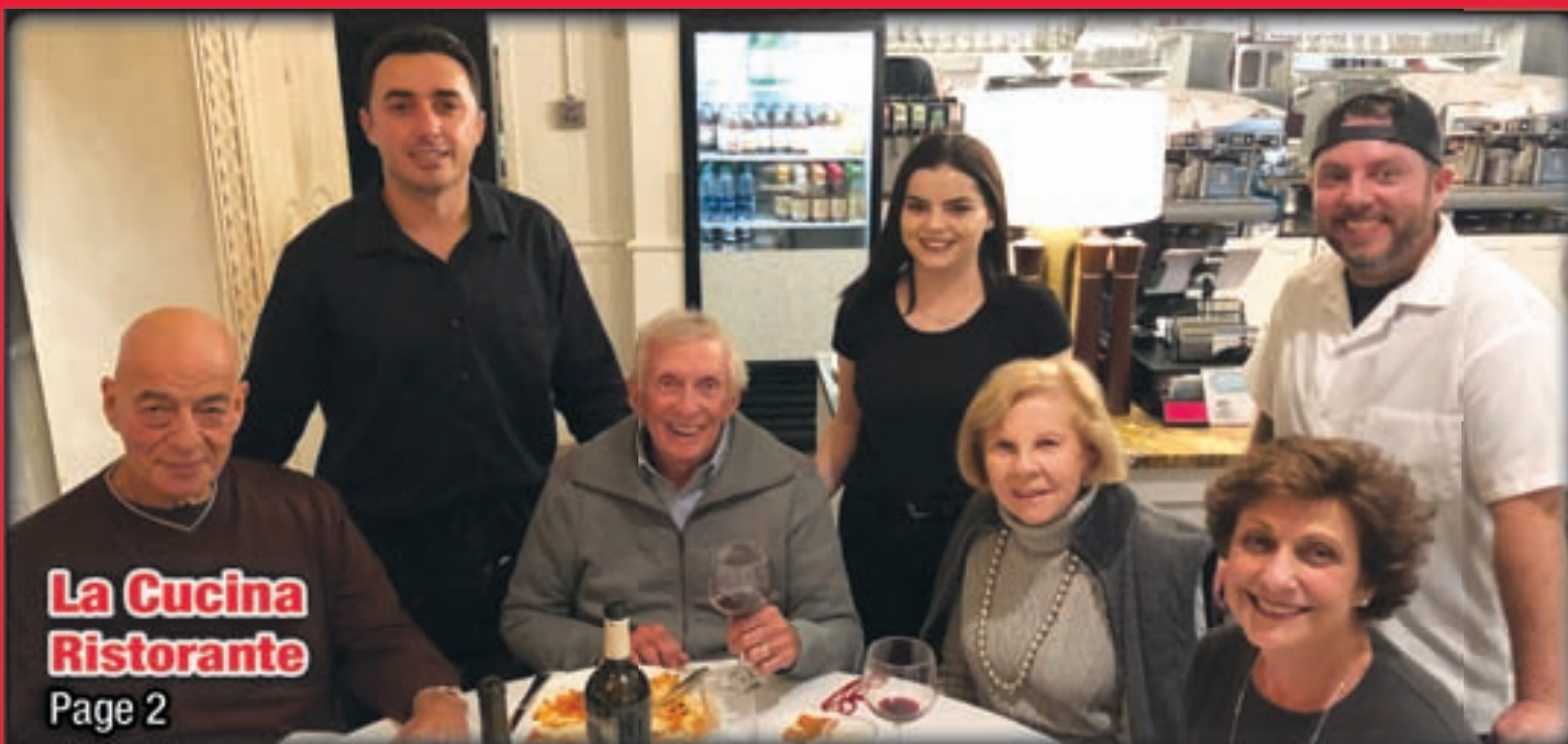
La Cucina Ristorante