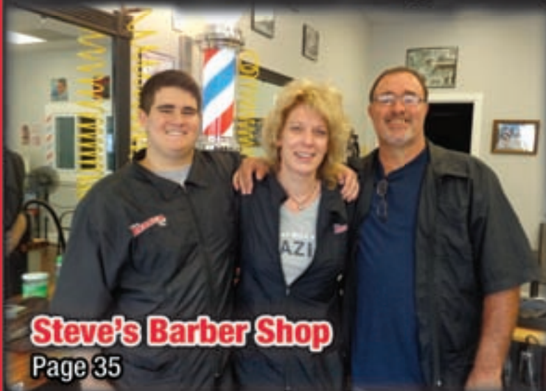
Steve's Barber Shop