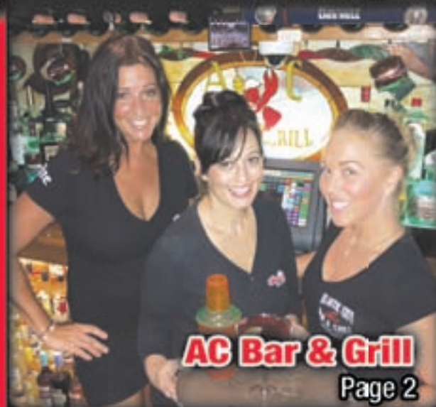
AC Bar & Grill